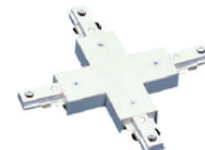
K611 Single/Two Circuit X-Connector Finish: WH/BK