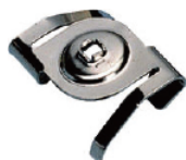
K604 T-bar Attachment Clips For T-bar Drop Ceiling Finish: WH/BK/SN