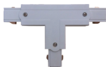
K609 Single/Two Circuit T-Connector Finish: WH/BK