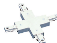
K611 Single/Two Circuit X-Connector Finish: WH/BK