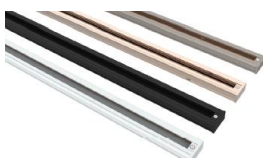
K5-3 Single Circuit/Two Circuit Track Single circuit track is rated for 2400W features 12-gauge copper conductors and

a separate ground conductor. Two circuit track includes 12-gauge copper conductors and features a double load capacity at 4800W max. Single/Two Circuit Track is available in white,black,and satin nickel finishes,and in 4,6,and 8-foot sizes,and can also be field cut to your preference.