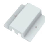
K605 Single/Two Circuit Floating Canopy Finish: WH/BK