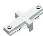
K608 Mini Coupling Finish: WH/BK