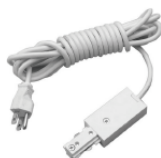
K612 Live End With Cord&Plug Finish: WH/BK Available in 2 wire,3 wire,4 wire