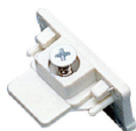
K607 Track End Cap Finish: WH/BK