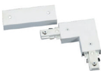
K610 Single Circuit 90 °Connector Finish: WH/BK