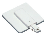
K606 Single/Two Circuit Live End With Box Cover Finish: WH/BK