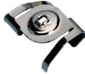
K604 T-bar Attachment Clips For T-bar Drop Ceiling Finish: WH/BK/SN