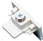
K607 Track End Cap Finish: WH/BK