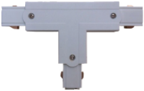
K609 Single/Two Circuit T-Connector Finish: WH/BK