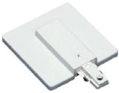
K606 Single/Two Circuit Live End With Box Cover Finish: WH/BK