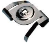
K604 T-bar Attachment Clips For T-bar Drop Ceiling Finish: WH/BK/SN