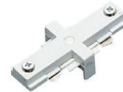
K608 Mini Coupling Finish: WH/BK