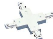
K611 Single/Two Circuit X-Connector Finish: WH/BK