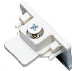
K607 Track End Cap Finish: WH/BK