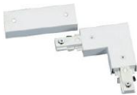
K610 Single Circuit 90° Connector Finish: WH/BK