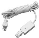
K612 Live End With Cord&Plug Finish: WH/BK Available in 2 wire,3 wire,4 wire