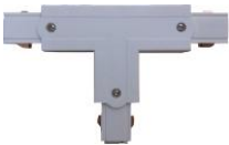
K609 Single/Two Circuit T-Connector Finish: WH/BK