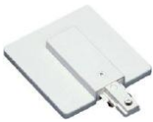
K606 Single/Two Circuit Live End With Box Cover Finish: WH/BK