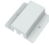
K605 Single/Two Circuit Floating Canopy Finish: WH/BK